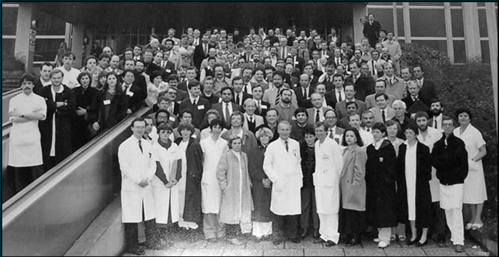
Live course on balloon valvuloplasty in Rouen (France)